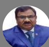
JP Sinha, Former ED IOCL